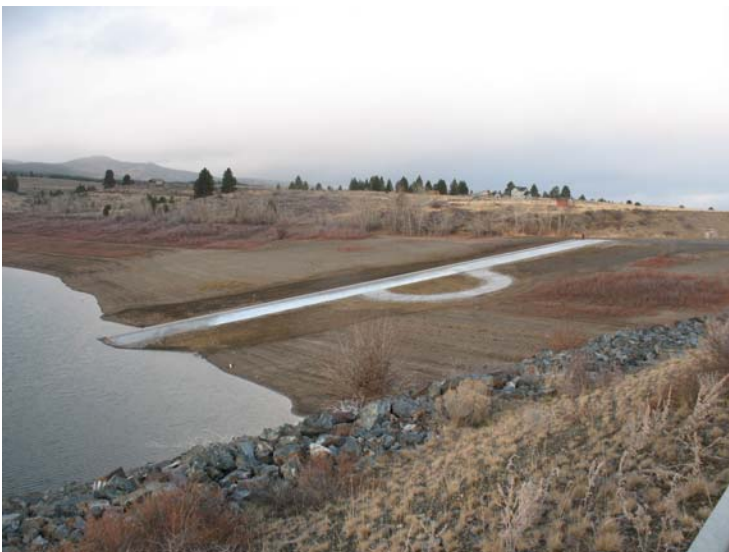
Recently completed ramp at Wolf Creek Reservoir, Union Co.