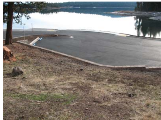
Recently completed parking area and ramp, Willow Point, Jackson Co